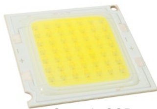
Ceramic COB Light Engine Series 陶瓷基板光引擎